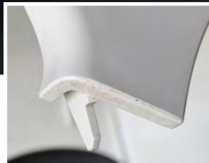
BEFORE CLEANING: Part contamination by mold residues