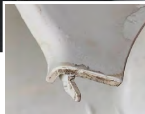
DURING CLEANING: Heavily contaminated part pulled from mold after application of Lusin® MC1718