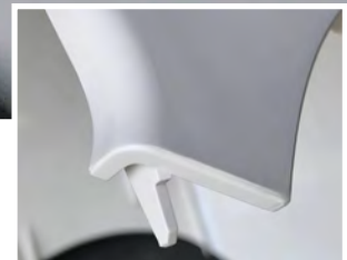
AFTER CLEANING: Part after mold cleaning with Lusin® MC1718